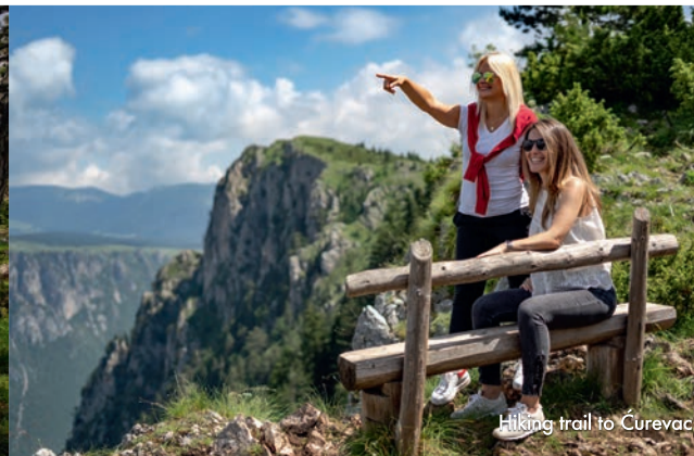
Hiking trail to Ćurevac