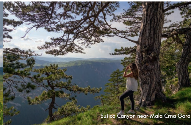
Sušica Canyon near Mala Crna Gora