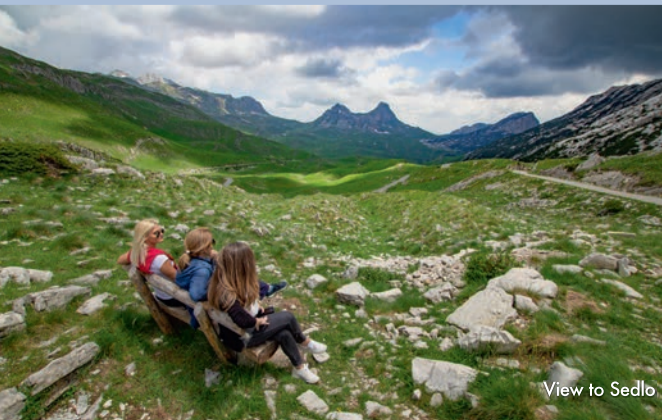
View to Sedlo

From Sedlo, the road descends again. The circular 6.2 km "Jezero" trail begins a little below the prominent peak of the Stožina (approximately a three-hour walk). It passes the small picturesque lakes of the valley Pošćenska Dolina. The last part of the route leads along the main road from Šavnik to Žabljak and, once again, offers a magnificent view of the Durmitor Mountains, with the Savin Kuk (2,313 m) in the foreground, before the route returns to the centre of Žabljak.