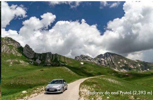
Todorov do and Prutaš (2,393 m)