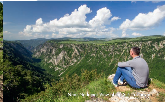
Near Nedajno: View of the Sušica Canyon